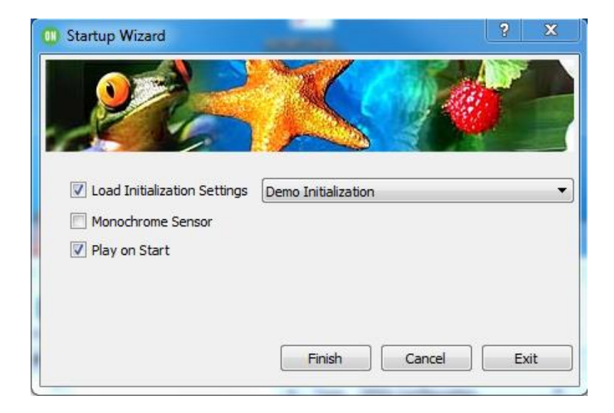
Figure 2: Startup Dialog

2. After the software has found an attached device, the DevWareX window will appear with the dialog box shown in Figure 2 on page 3; select the settings shown. (Color/monochrome sensors will also need to have the color or monochrome box checked, as appropriate.) Click "Finish."